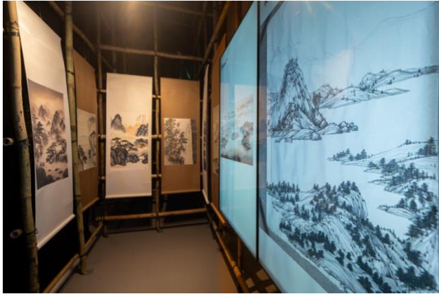
Challenging AI: The Paintings of Chui Pui Chee by Chui Pui-chee